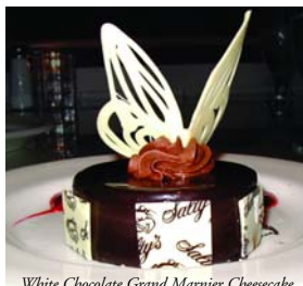
White Chocolate Grand Marnier Cheesecake

Gibson's learning experience in Belgium wouldn't be complete without studying the complexities of sugar. Though chocolate still contains a lot of sugar, Barry Callebaut has developed a chocolate with 30% sugar reduction. It has a low glycemic index with 8% less calories. Does this mean we can eat more?