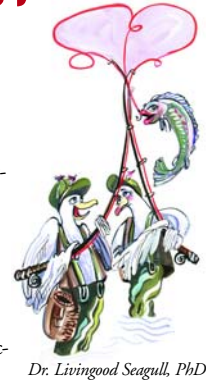
Dr. Livingood Seagull, PhD